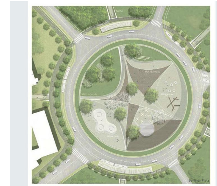
Round-about main concept, center poin of the project.

The designed zone, it has been divided into three parts, creating contrast between them. The left part is the combination of all, with predominance of residential and commercial buildings, with light elements of agriculture and little private gardens, green and public spaces. The round-about contains tram statio and it creates also the main public space. The right part is more calm area full of detached houses and agriculture, with own and common gardens. Under the electricity lines are placed the third of designed zones- it is the activity area