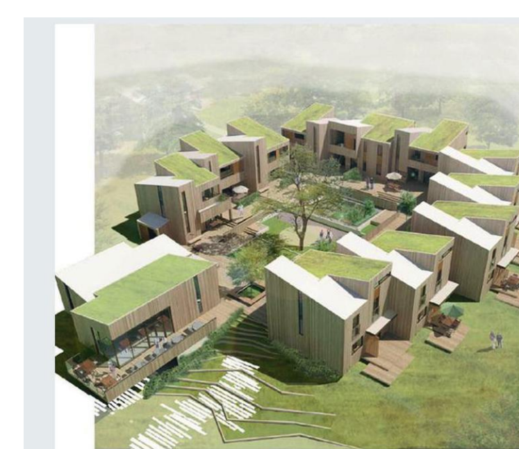
Residential areas, blocks with gardens.